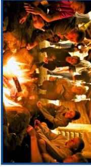
"This was an incredible experience I will never forget."