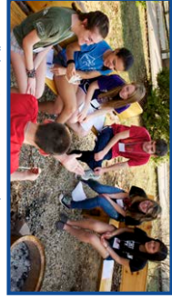
"This trip gave me much more confidence in myself..."