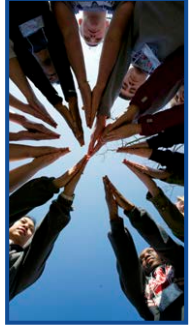
"I now have the confidence and knowledge to lead groups."

LEADERSHIP. TEAMBUILDING. COMMUNICATION. PRESENTATIONS. DISCUSSIONS. RYLA.